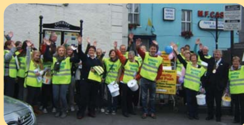
Wave off in O'Connell Square