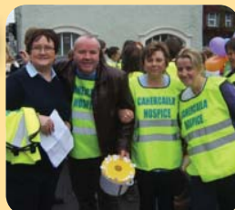
Cahercalla staff members volunteering on the day