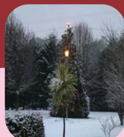
Last Years Tree adorned with its lights in the Snow.