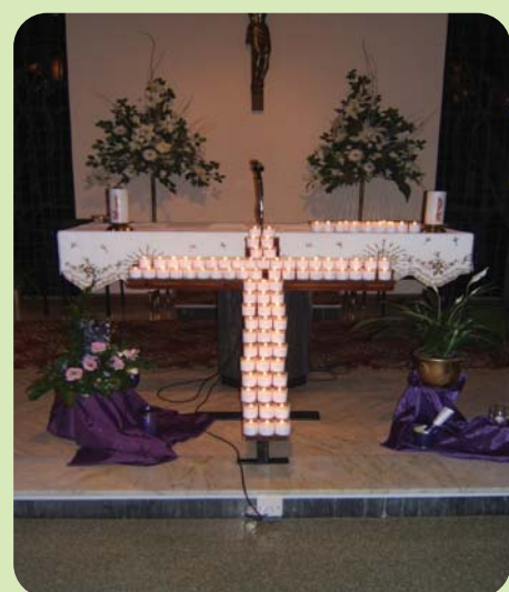
Memorial Candles being arranged before November Memorial Mass.